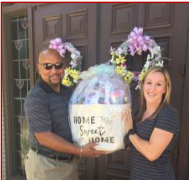
Basket Raffle Winner!

While this description is not exhaustive, we hope that it is helpful to couples considering marriage. Call the parish office with any questions concerning marriage preparation.