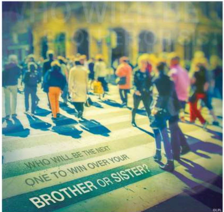
23RD SUNDAY IN ORDINARY TIME

Jesus challenges his disciples to confront sin directly, even when it occurs with those closest to you. Why do you think Jesus encouraged this approach?